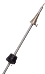
Interchangeable probe, 180 mm