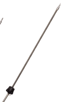
Flexible probe, 400 mm