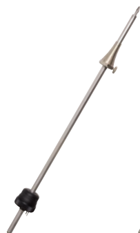
Interchangeable probe, 300 mm