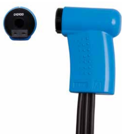
Base handle for interchangeable probes