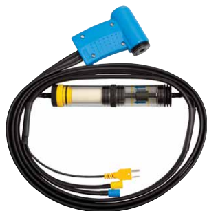
Base handle with hose and condensate filter cartridge